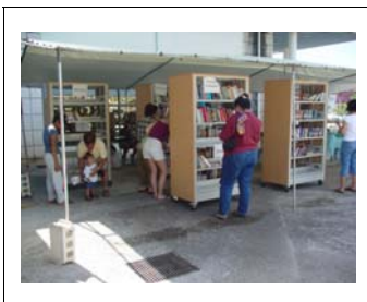
Book shoppers at the Sale.