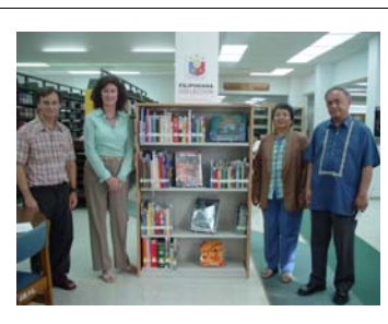
Unveiling Ceremony with the Philippine Consul General.

The collection consists of 110 books and 2 CD-Roms on Philippines history and culture. The collection will help to serve the library’s Filipino patrons and offer an interesting variety of materials for any reader interested in the Philippines. Joeten-Kiyu Library urges patrons to make use of the new materials. Future programs will be presented to encourage the use the collection.